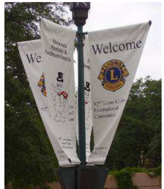
Banners lined the streets of Nicollet Mall to welcome Lions from around the world from our district.