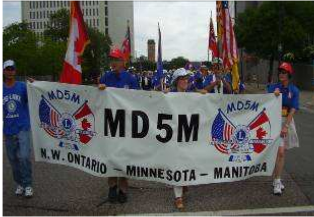
Our great group from MD5M!