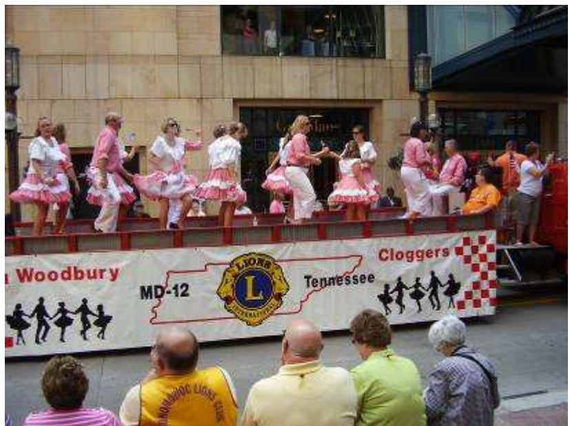
Lion's Club from MD-12 in Tennessee clogging in the parade