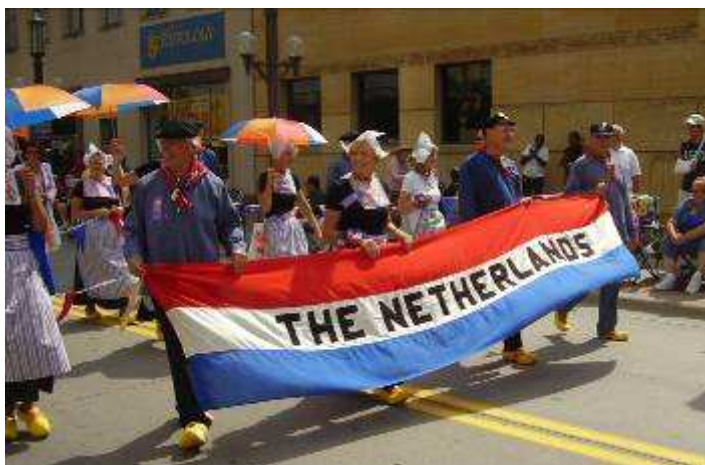
Netherlands in their native dress (notice their clogs for shoes) in the parade