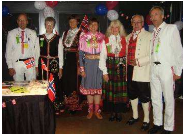
The Scandinavian countries (Denmark, Finland, Norway, Sweden, Iceland) in full costume at their hospitality night they hosted.