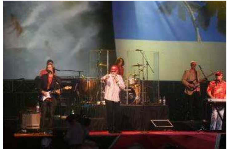
The Beach Boys in concert – they put on a great performance!