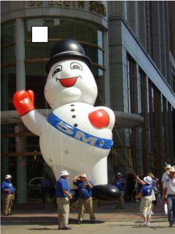
The HUGE 5M snowman balloon that volunteers had to pull down so it could "do the limbo" under the skyways!